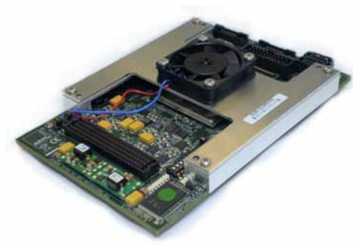
LogicTile Express 3MG with ARM Cortex-R5 SMM

The implementation uses standard ARM CoreLink<sup>™</sup> System IP components to implement a basic SoC design to mimic the test chip developments of our CoreTile Express products.