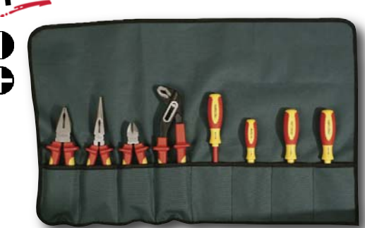
Pliers/Cutters Made in Taiwan Screwdrivers Made in Germany