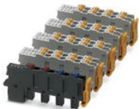
Axioline F plug set (for e.g., AXL F DI32/1 2H)

Please be informed that the data shown in this PDF Document is generated from our Online Catalog. Please find the complete data in the user's documentation. Our General Terms of Use for Downloads are valid ( http://phoenixcontact.com/download )