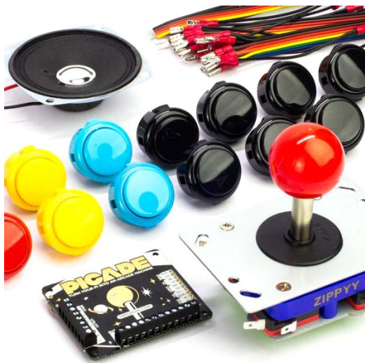
HAT & Parts Kit PIM252